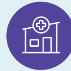
Nursing Homes / Long-Term Care Facilities

If you're a nurse who has been working in smaller regional or rural healthcare facilities, you may want to consider expanding your practice scope by taking a travel nurse assignment at a large teaching hospital or magnet facility. The amazing thing about traveling is you can choose the type of facility you want to work in which opens the doors to tremendous learning and growth opportunities.