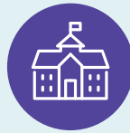
Academic and Research Centers