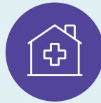
Home Health Organizations