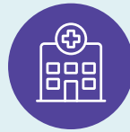
Mid-Size & Smaller Hospitals