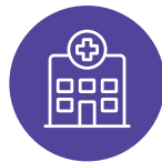
Mid-Size & Smaller Hospitals