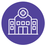
Large Academic Medical Centers

American Mobile typically has travel nurse job openings in the following types of facilities: